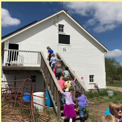
ABOVE: MAY 2023: Local public school 1st grade visits for a second year seeing our newly