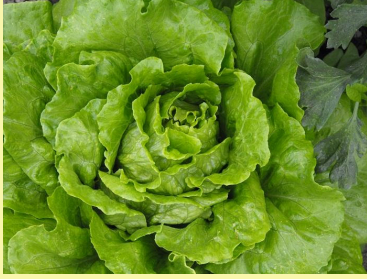
VICTORIA LETTUCE , one of the many delicious lettuces! TAKE A LOOK!