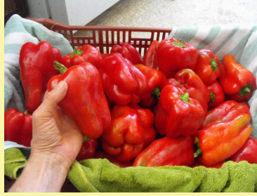
KING OF THE NORTH SWEET PEPPER , great in north or south! CHECK OUT THE PEPPERS!