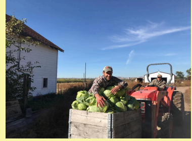
FILDERKRAUT AND DOTTENFEDLER CABBAES from our seed in zone 4! SEE THEM!